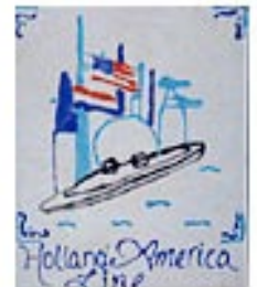
ART WALK Tiles made by children adorn benches and line a route from the Peekskill waterfront to the Hudson Valley Center for Contemporary Art.

Nearly three years in the making, the Public Tile Project trail — a permanent installation — follows the course of McGregory's Brook, which served as a delivery route for arms during the Revolutionary War. The tiles will also help identify artworks displayed during the center's Peekskill Projects, which present installations by local artists, many along the trail.